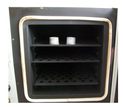
Fig. 1. Drying cabinet for measuring the moisture content of finished products SNOL (Ukraine)

From the physicochemical parameters, humidity was determined by drying to constant weight at a temperature of 105 °C (Fig. 1).